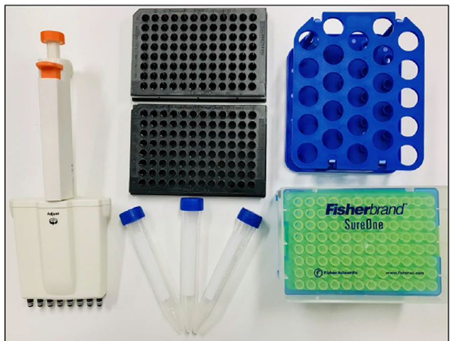
FIGURE 2 Hardware needed for the high-throughput method detailed here: multi-channel pipette with autoclaved pipette tips, black 96-well plates, 15 ml centrifuge tubes with caps and holder.

Prior to starting the assay, we calculated the entire amount of media needed for the assay and made a large primary solution consisting of COMBO and algal food ( 1.0 \text{ mg dw L}^{-1} ). We determined the relationships between algal density ( \text{mg C L}^{-1} ) and optical absorbance (800 nm 1 cm cuvette) using a regression-based relationship between absorbance and dry mass (a close correlate of carbon). To ensure that the algal food and media remained evenly mixed and consistently distributed for each biological replicate (individual centrifuge tube), we placed the beaker of primary solution on a stir plate (rotating at low-medium speed). We pipetted 10 ml of media into individual 15 ml centrifuge tubes.